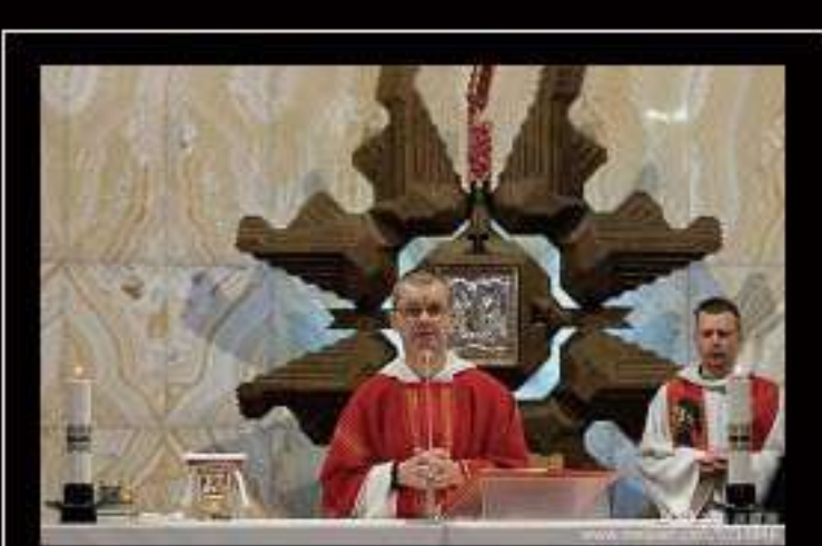
House of Worship